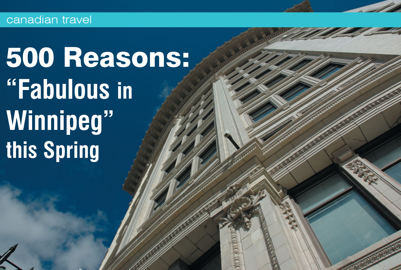
Winnipeg’s Exchange District architecture is always worth looking up for.

For one week this spring, Winnipeg will be the gay destination in Canada. It’s a great spot all year long, but from May 21 through 24 , hundreds of gay and lesbian musicians will converge in the middle of the prairies for the GLBT Unison Canadian Choral Festival .